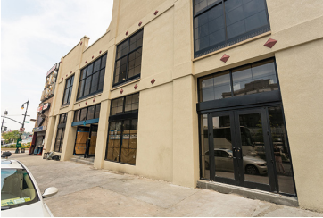
Metropolitan West will feature the Exhibitor Hall, Gallery, and pop-up cafés.